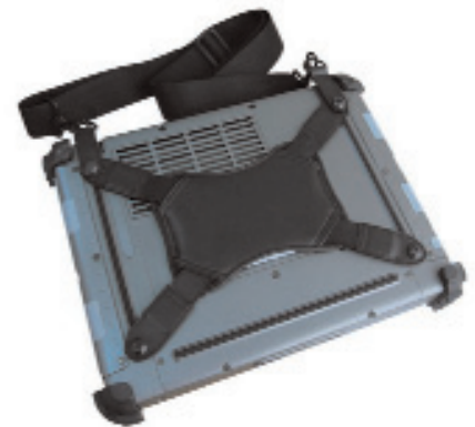
Hand and shoulder strap