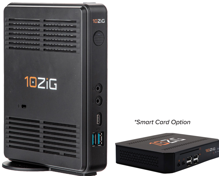
*Smart Card Option

Each Trusted Zero Client comes with a year of the HP Anyware Trust Center Subscription. The Anyware Trust Center subscription enables enhanced Anyware Trust Center features, allows Trusted Zero Client firmware to be updated, and includes support from HP. Trusted Zero Clients have the ability to connect to HP Anyware, Amazon Workspaces, and VMware Horizon** platforms. Trusted Zero Clients can also be managed by the FREE 10ZiG Manager™ with unlimited licenses.***